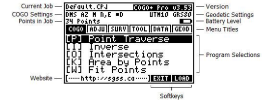
The main user interface of COGO+

The integrated user interface creates a easy to navigate menu system from which all the features can be accessed.